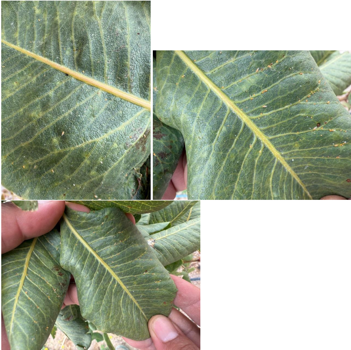
Figure X: The size, colour, and distribution of Agonoscena pistaciae and their droppings on leaves as a result of feeding adults and nymphs(acquired visual images using a cell phone).