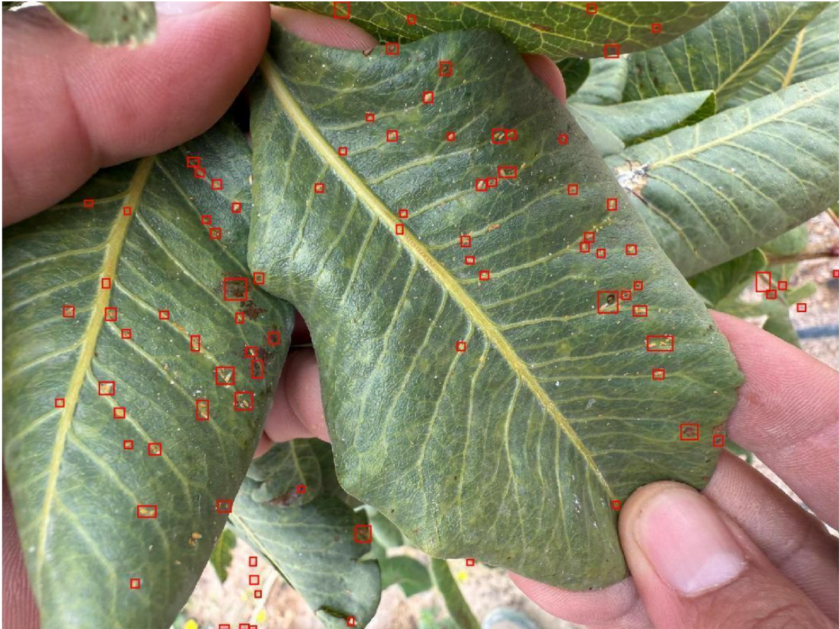
Figure XX: Overlay bounding boxes after running a Matlab-developed code over seven raw RGB images, giving an overview of RGB + bounding boxes. Image seven is shown for easier discussion.

It is up to the users to decide whether this version is sufficient, given the other challenges in data acquisition.